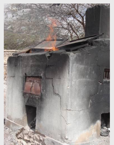
Fig. B.1 – Old incinerator used at General Group Hospital before the intervention

The three incinerators were built between February and June 2009 by local enterprises under the supervision of the Italian NGO leading the project (see Fig. B.2). Specific trainings were elaborated and delivered in order to explain how to correctly operate and maintain the incinerators. Initially, the availability of the appropriate construction materials was the main technical issues faced. The construction of the incinerator at TB Hospital began using firebricks, as defined by the company in charge of the building. They flaked off, so it was decided to line the facility with a layer of cement and to use local stones, called deber , for the other two facilities.